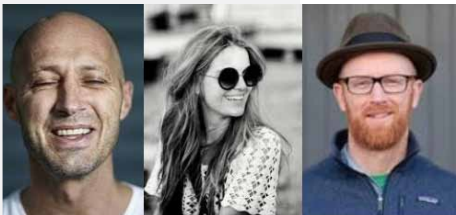
Cancer Dojo team

Getting in touch with the right people and learning that the right people are often hard to find and so they should be.