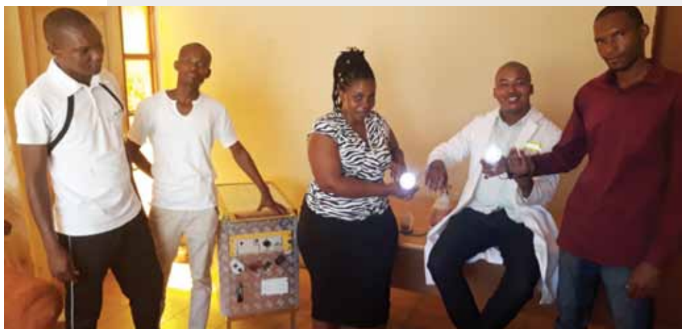
Bayon Holdings team

In Botswana there are numerous support structures aimed at empowering youth startups by the Ministry of Youth Empowerment, Recreation and Sports. These have proved helpful over the years so far, but there is a barrier to more scientific projects or products. I strongly believe that we are still under the impression that only overseas products are of quality or are worth supporting. I hope one day this will be different and we will give our fellow scientists the benefit of the doubt. I must, however, applaud and commend