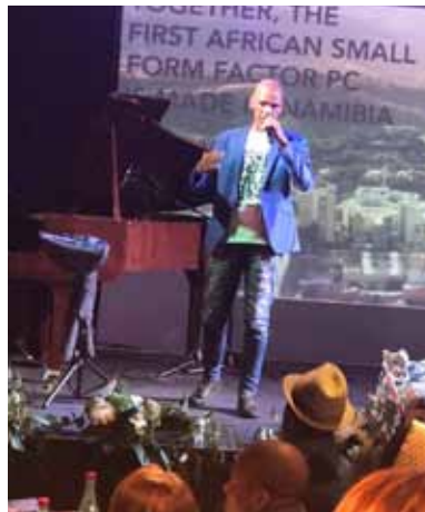
PEBL founder sharing about his company at the Finland World Ideas in Namibia in October 2018.

Despite the rising popularity of entrepreneurship in Namibia and elsewhere in Africa, being a startup brings with it its own unique set of challenges and problems that must be addressed. Innovation culture in Namibia is still in its infancy. Challenges include financing, as most potential investors are conservative investors who look at products like real estate. This has caused us to adopt a particularly lean and agile development approach. We have made it our key