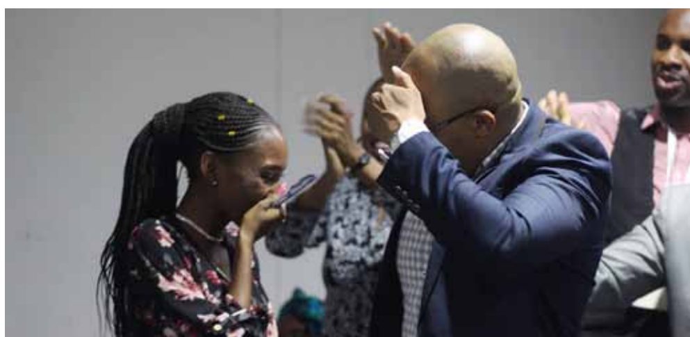
Ecohub after winning a spot at Slush at the pitching competition in Gaborone, Botswana 2017

Keep believing in yourself, stay true to yourself and your journey. Never ever give up and just know that one day success shall come and you shall reap the benefits of your hard work, perseverance and dedication. Enjoy the journey!