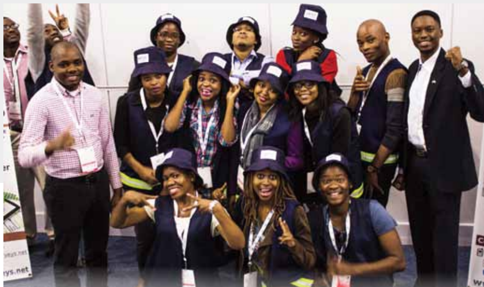
One of Focus Surveys data collector teams after another project completed.

I learnt how to communicate my value proposition to various stakeholders through pitching and client presentations to team members and funders. I have learnt how to manage some key components of my startup such as financial management, record keeping, stakeholder planning and management, business administration, innovation planning and product development planning. I have learnt through mentorship that often your success is determined by how fast you execute your plans.